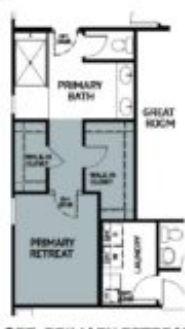
OPT. PRIMARY RETREAT ILO FLEX