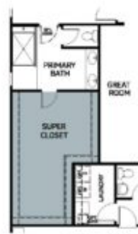
OPT. SUPER CLOSET ILO FLEX