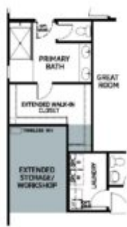
OPT. EXTENDED STORAGE/ WORKSHOP ILO FLEX