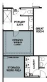
OPT. EXTENDED CLOSET w/STORAGE/WORK AREA ILO FLEX