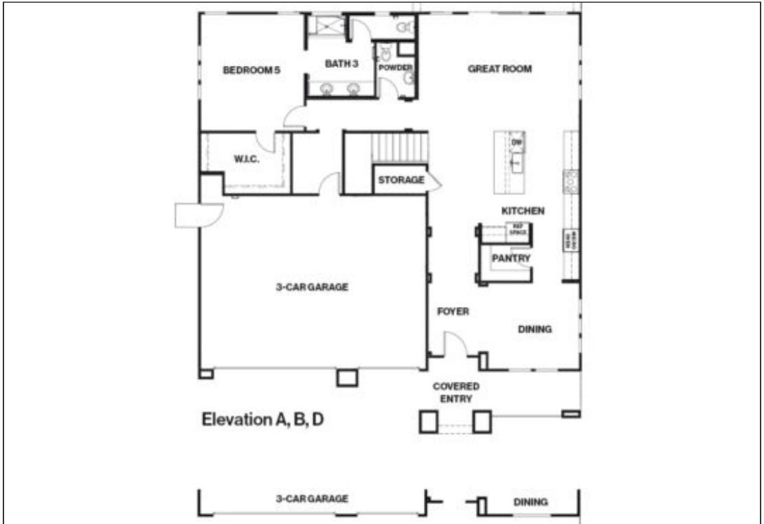
Floor Plan 1