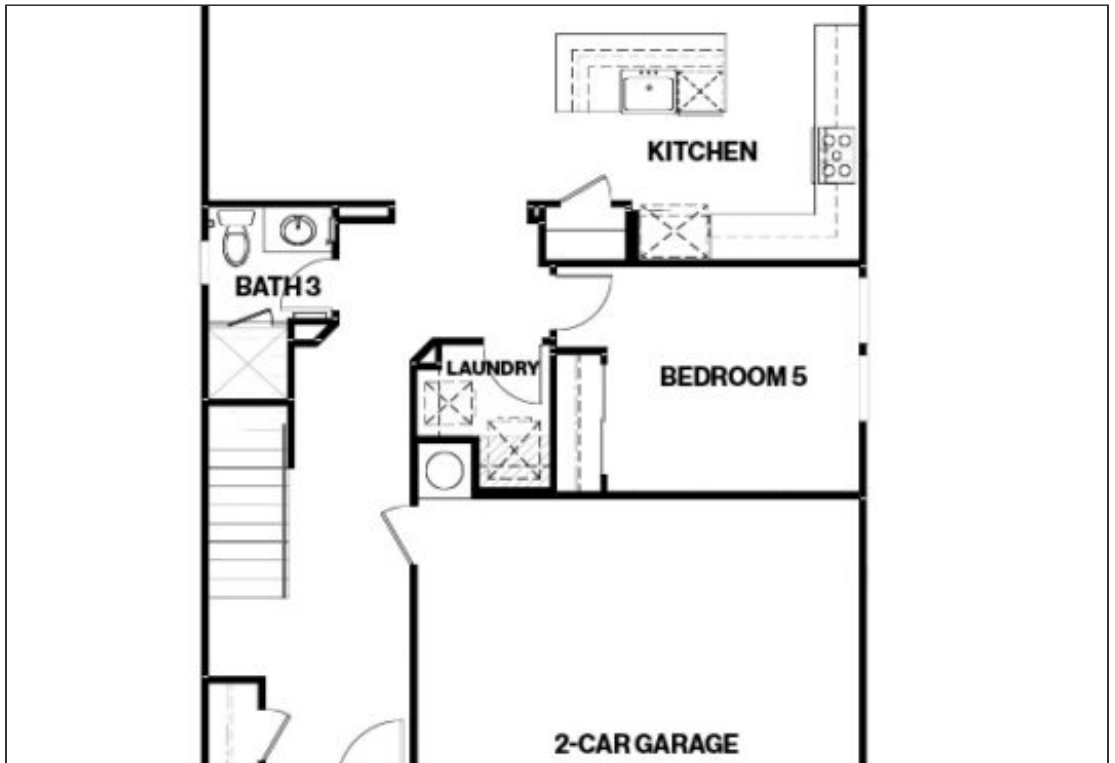
Floor Plan 1