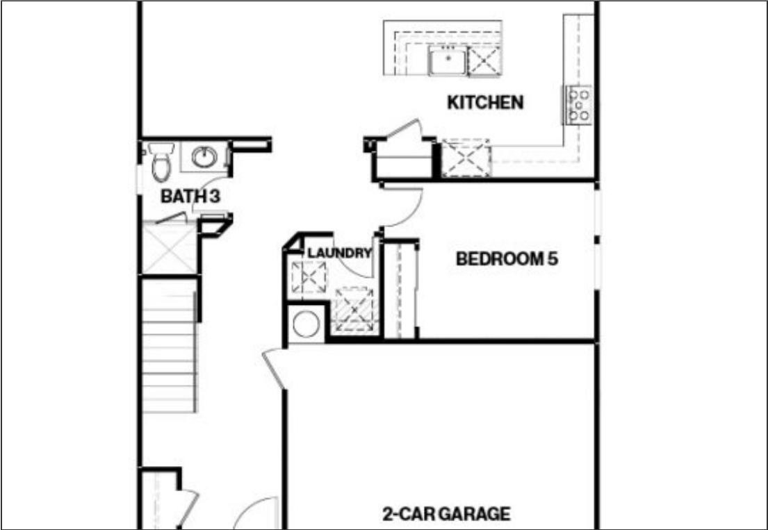
Floor Plan 1