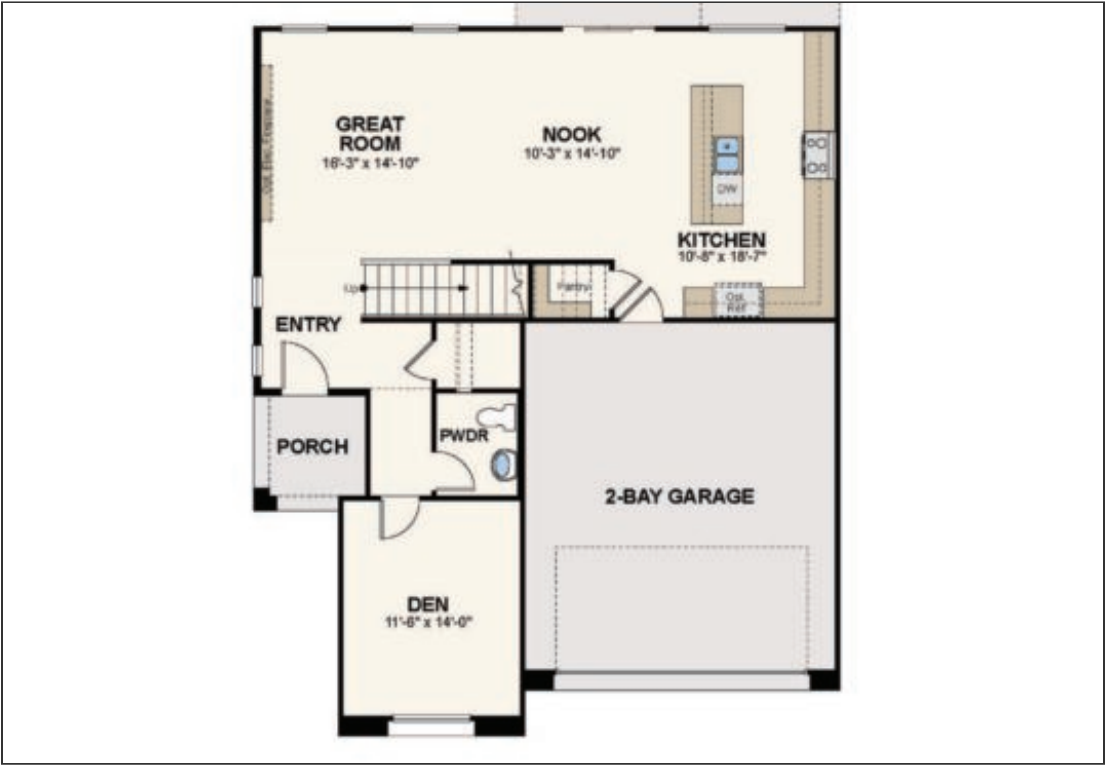
Floor Plan 1