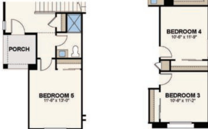
Floor Plan Pdf