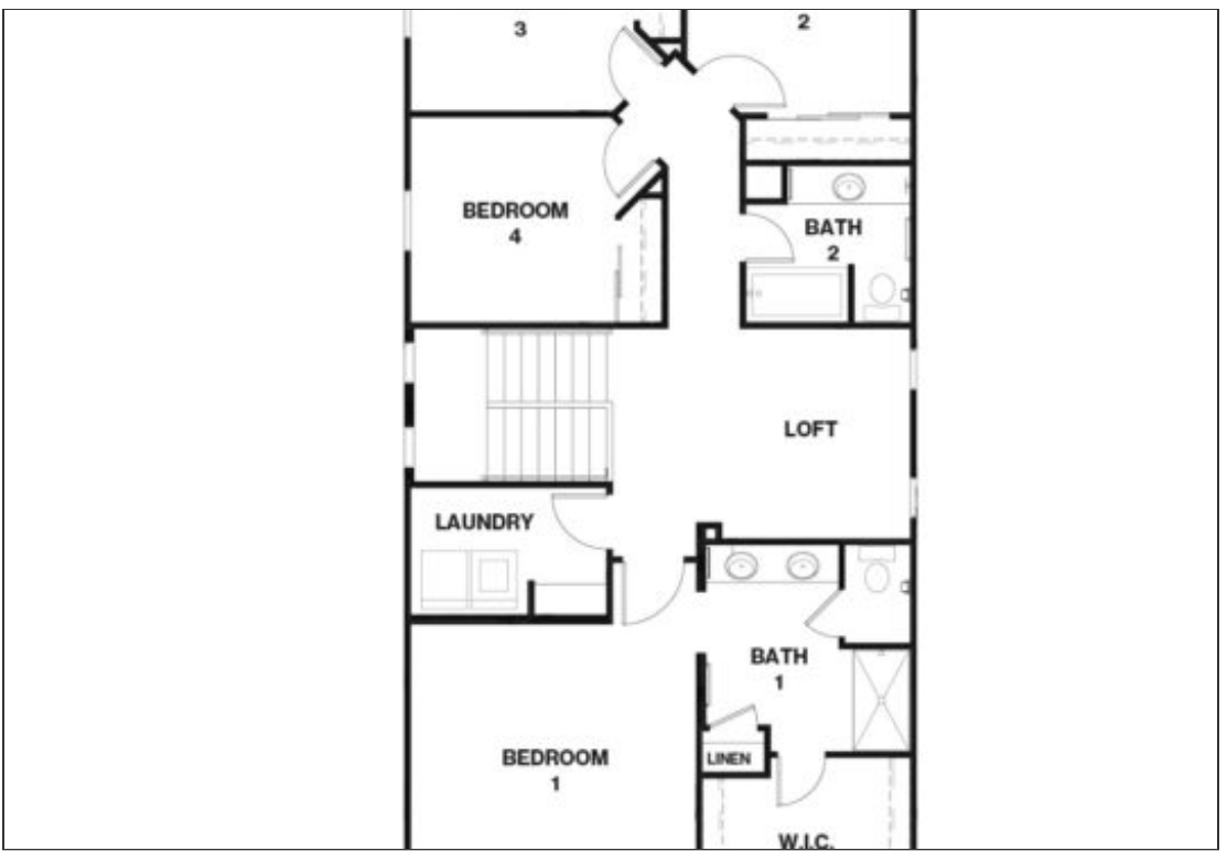
Floor Plan 2