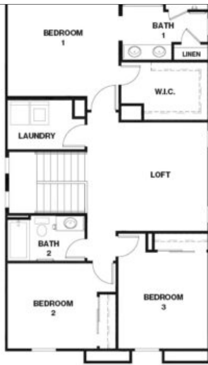
Elevation A, B, D