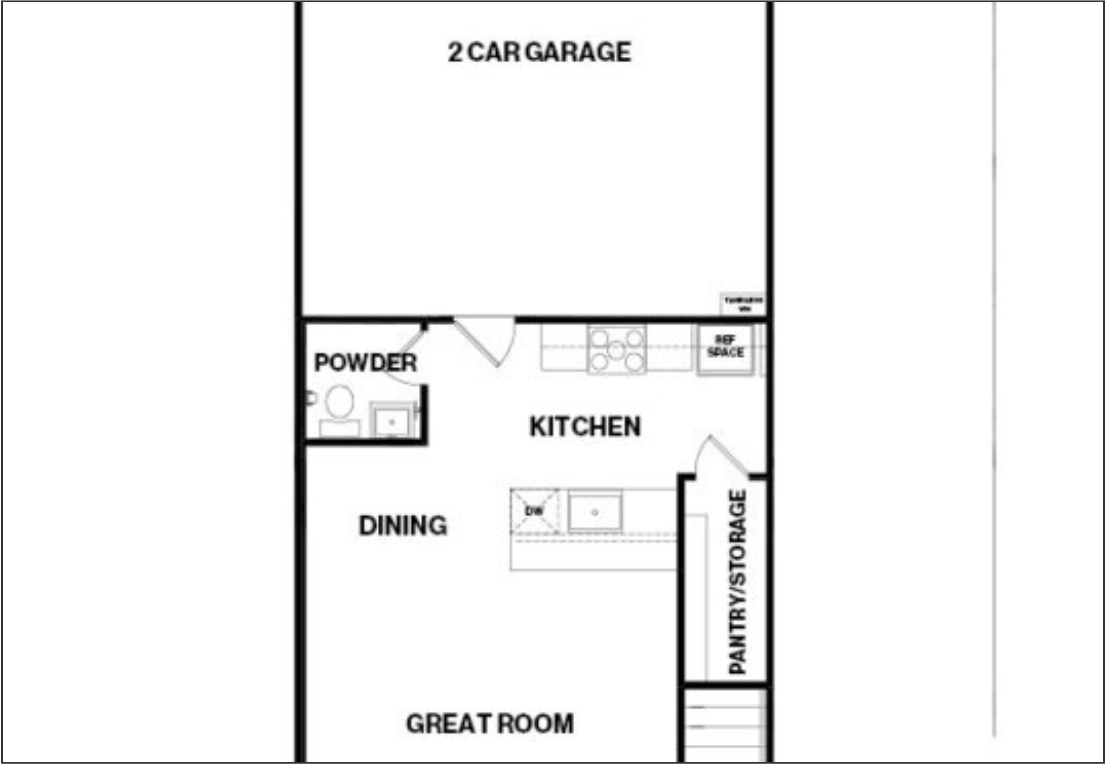
Floor Plan 1