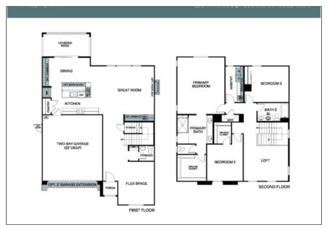
Floor Plan 1