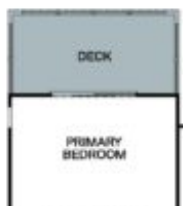
OPT. DECK AT PRIMARY BEDROOM