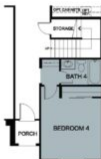
OPT. BEDROOM 4 w/BATH 4 I.L.O FLEX & POWDER