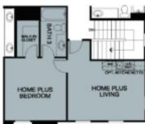
OPT. HOME PLUS SUITE I.L.O LOFT