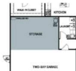
OPT. GARAGE STORAGE ILO BEDROOM 3 and BATH 3