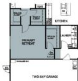
OPT. PRIMARY RETREAT ILO BEDROOM 3 and BATH 3