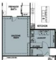
OPT. DRESSING ROOM & EXPANDED LAUNDRY ILO BEDROOM 3 and BATH 3