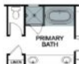
OPT. FREE STANDING TUB