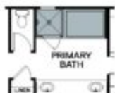
OPT. DROP-IN TUB

Woodside Homes reserves the right to change floor plans, features, elevations, prices, materials and specifications without notice. All square footages and