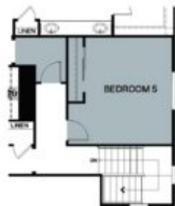
OPT. BEDROOM 5 I/O BONUS ROOM