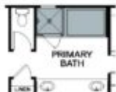
OPT. DROP-IN TUB

Woodside Homes reserves the right to change floor plans, features, elevations, prices, materials and specifications without notice. All square footages and