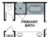
OPT. FREE STANDING TUB