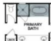
OPT. FREE STANDING TUB