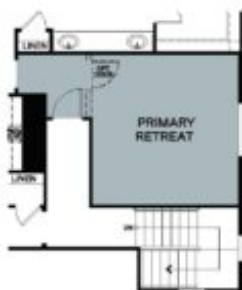
OPT. PRIMARY RETREAT ILO BONUS ROOM