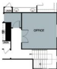
OPT. OFFICE ILO BONUS ROOM