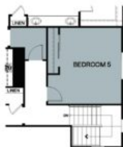
OPT. BEDROOM 5 ILO BONUS ROOM