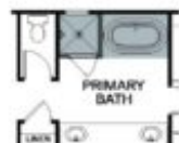
OPT. FREE STANDING TUB