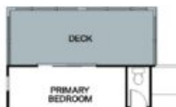
OPT. DECK AT PRIMARY BEDROOM