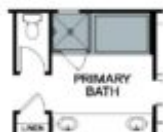
OPT. DROP-IN TUB

Woodside Homes reserves the right to change floor plans, features, elevations, prices, materials and specifications without notice. All square footages and