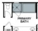
OPT. DROP-IN TUB