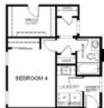
Optional Bedroom 4 and Bathroom 3 I/O Flex room and Storage