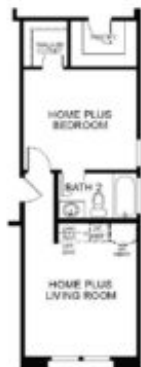
Optional Home Plus I/O Bedrooms 2 and 3