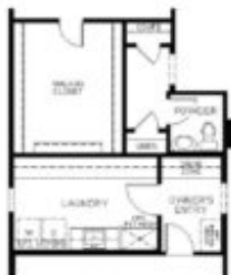
Optional Super Walk-in Closet and Laundry I/O Flex Room and Storage