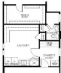
Optional Extended Walk-in Closet and Laundry I/O Flex Room and Storage