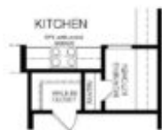
Optional Morning Kitchen