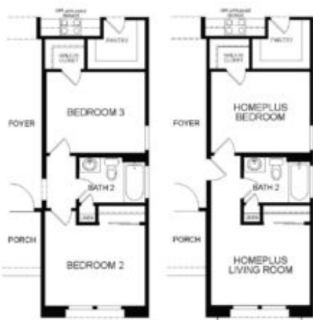
Optional Bedroom 3 ILO Flex Room